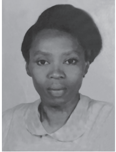
Mum and Dad arrival to the UK.