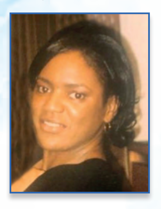
Service Tuesday 16<sup>th</sup> May 2023 at 12.30pm

Sunrise: 2<sup>nd</sup> August 1965 - Sunset: 22<sup>nd</sup> April 2023